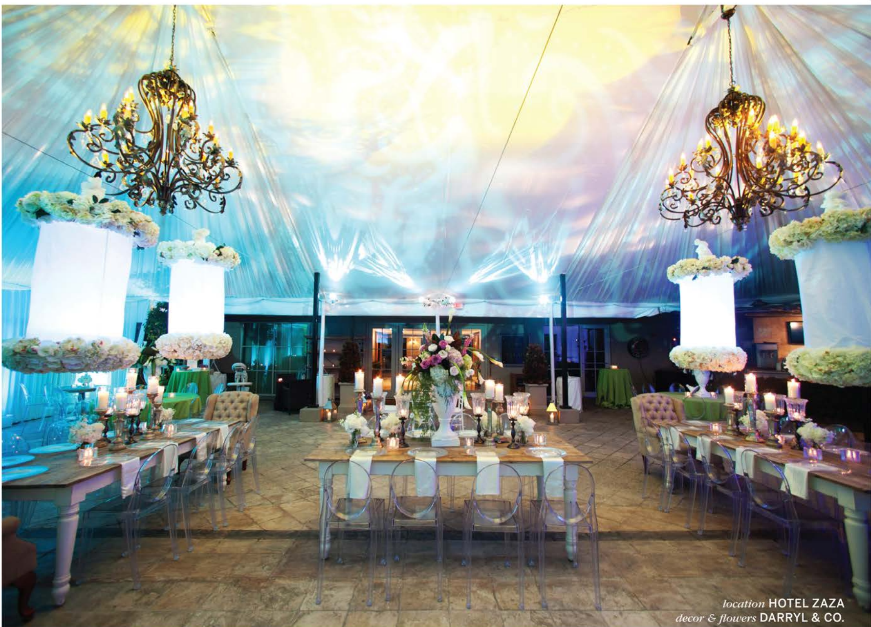
location HOTEL ZAZA decor & flowers DARRYL & CO.